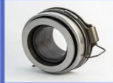
Clutch Release Bearing