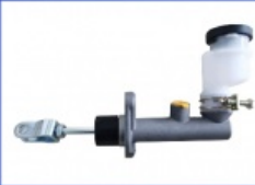
Clutch Master Cylinder